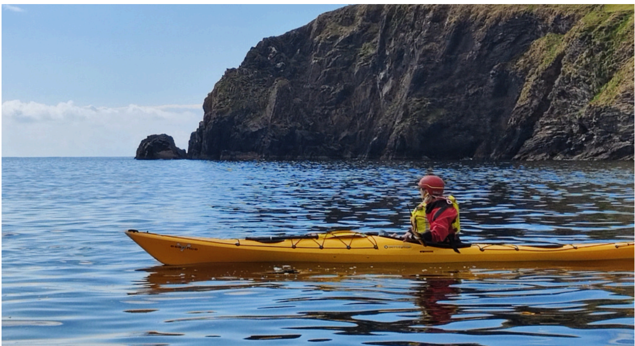
Atlantic Northwest North, a sea kayaking company funded by LEADER

The sub-themes are considered sufficiently broad and flexible to encompass the diversity of local needs in rural areas. For a project to be eligible for LEADER funding, it must be linked to at least one of the LEADER sub-themes.