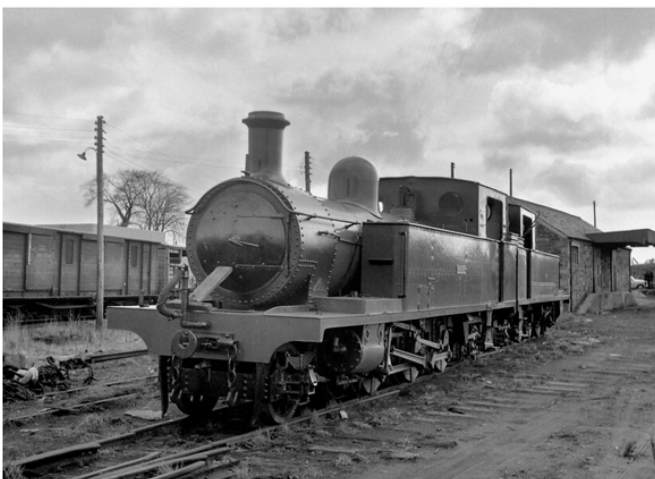
Donegal Railway locos 'Meenglas' and 'Drumboe' (behind) awaiting preservation at Strabane. 3.4.63.