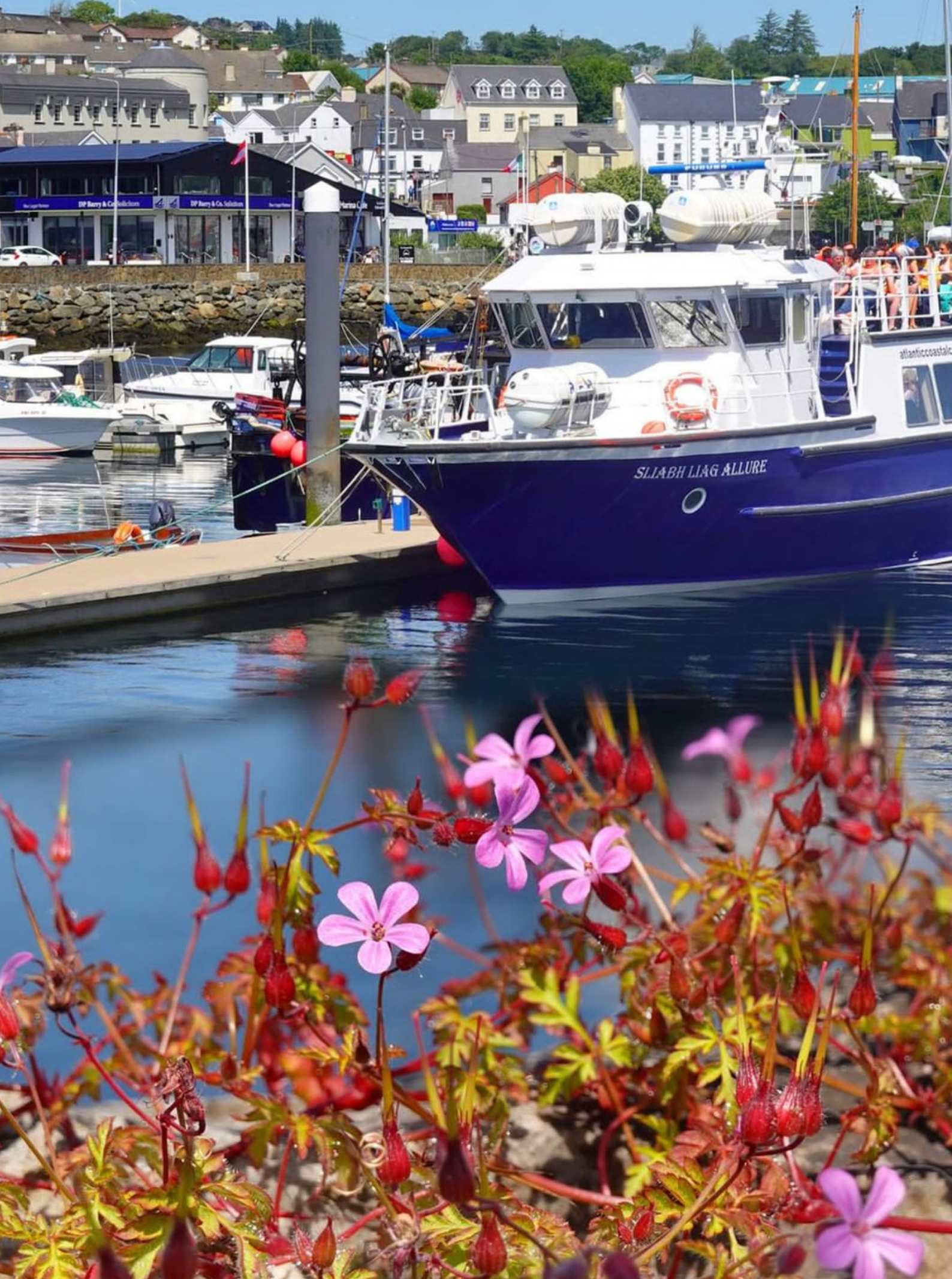
The Slieve Liag Allure funded by LEADER