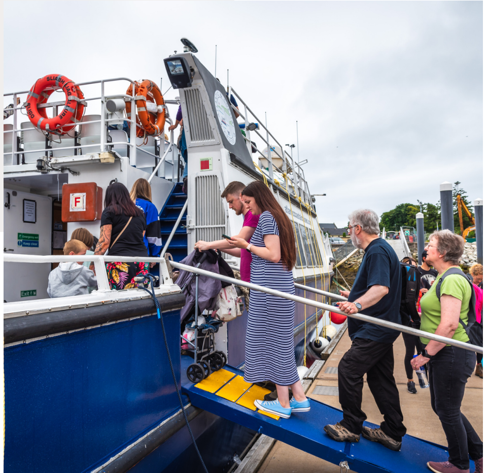
Pictured: MV Slieve Liag Allure awaits visitors in Killybegs harbour

“The funding has empowered us to provide a unique cruise experience, attracting visitors to Killybegs and creating employment opportunities. The Slieve Liag Allure stands as a symbol of the collaborative success between businesses and funding initiatives.”