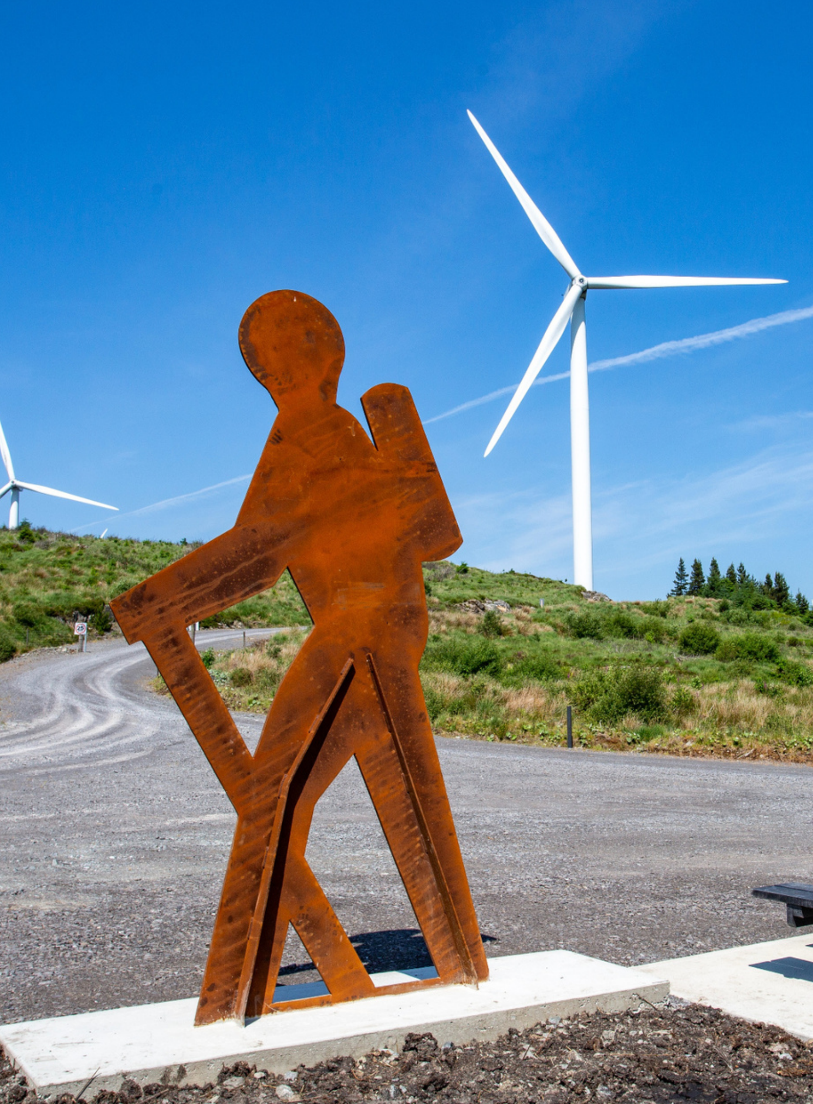
'The Walker' sculpture at Meendreen Wind Farm - funded under the last programme