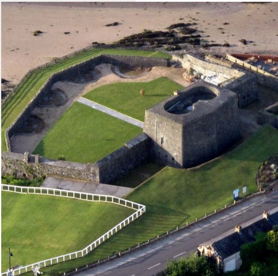
Pictured: Aerial View of The Battery Rathmullan

“LEADER has allowed us to embark on a journey to restore and showcase Rathmullan's historical gem, ensuring that it remains an enduring symbol of our past for future generations to appreciate.”