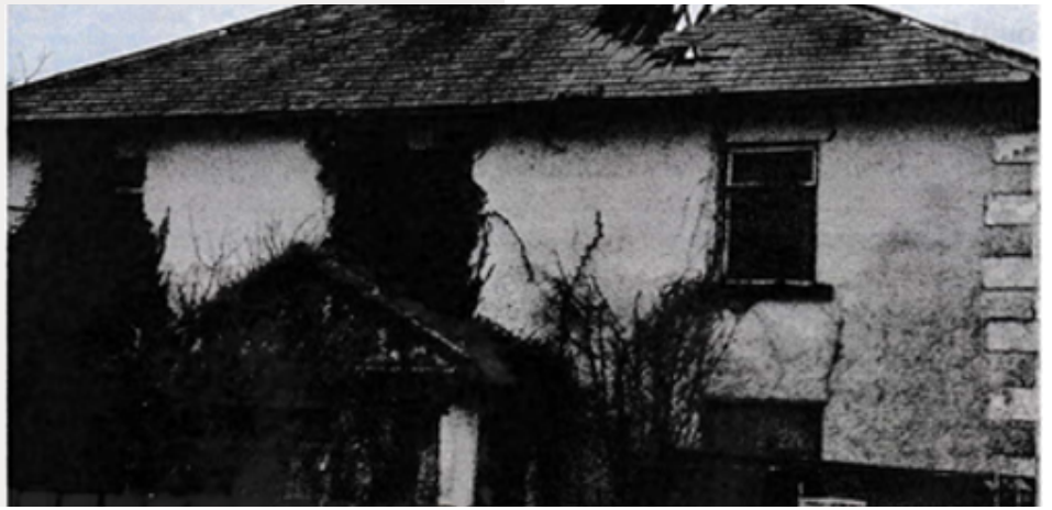
Pictured: The Killygordon Youth Club before refurbishment

"It has allowed us to create a modern, accessible, and inclusive space that will positively impact the lives of the young people we serve and the broader community"