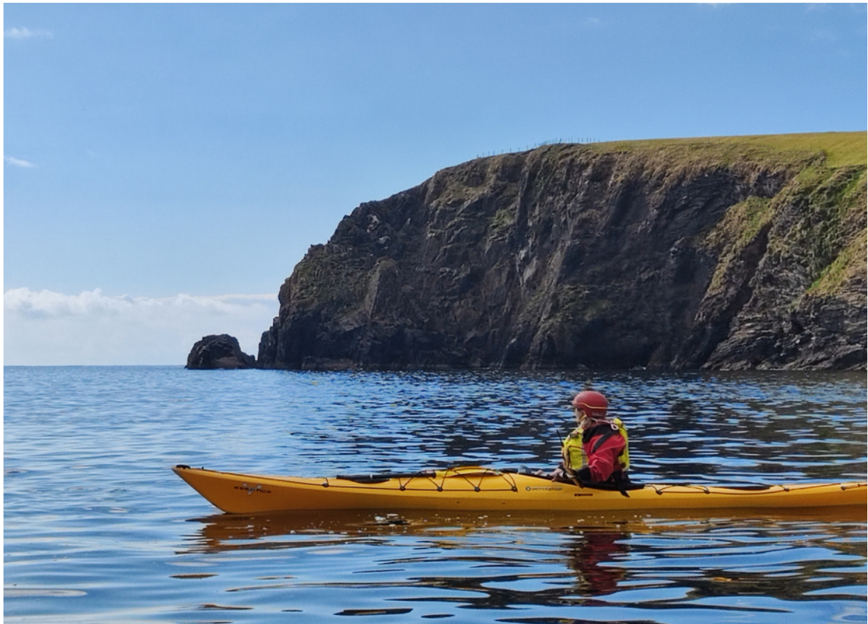
Atlantic Northwest North, a sea kayaking company funded by LEADER

In the pages that follow, we invite you to explore the application process and what's involved, read the stories behind impactful projects, and the transformative influence that LEADER continues to exert on the economic and social fabric of County Donegal.