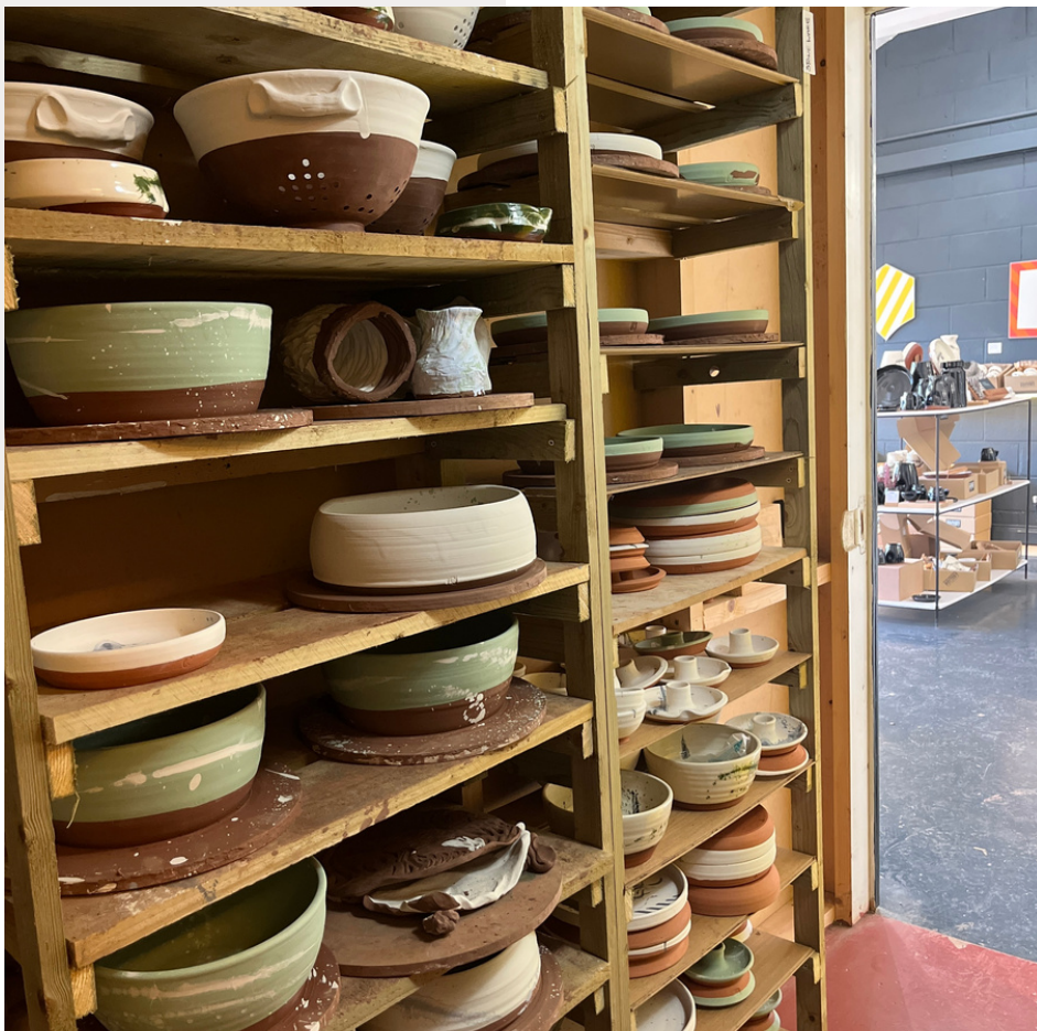
Pictured: A selection of Kevin Callaghan Pottery

The investment has made the studio more attractive for tourists, drawing in visitors who are interested in the seeing the authentic crafting process — from clay to the final product, all crafted on-site.”